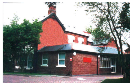
The Grange Medical Centre

Don't forget your flu jab! Clinics are now on.